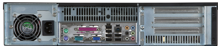
I/O connectors are dependent upon the model selected. See specifications for details.