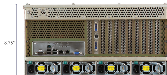
I/O connectors are dependent upon the model selected. See specifications for details.